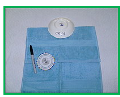
Step 3. Cut along the line, through both thicknesses. Open the towel out flat.

Centre a 15cm saucer over the line marked in Step 1. This will form the cutting line for the head hole of the bib.